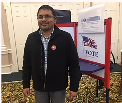
First time voting as an American citizen at the Mason Christian Village polling location.