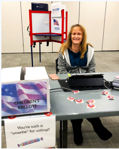
Kids were given candy and stickers in exchange for their "Children's Ballot".

PEO's at the YMCA created a wonderful opportunity with their "Children's Ballot", providing Smarties for voting. Issues on the Children's Ballot included, "Favorite Color," "Favorite Shape," and "Favorite Ice Cream".