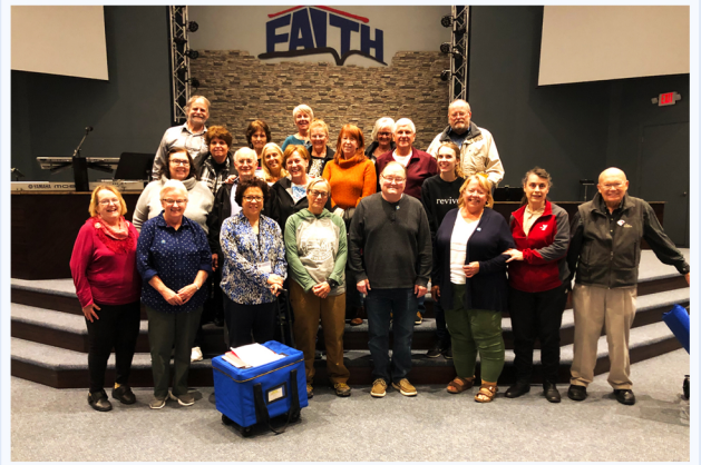
Precinct Election Officials on Election Day at the Faith Building Church polling location.