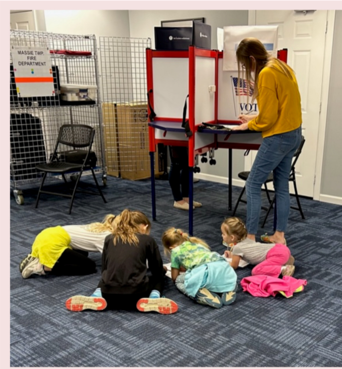
Kids hard at work on their ballots at Clinton Massie Township Fire Department.