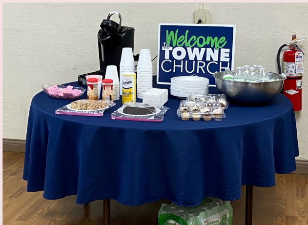
Towne Church welcomed their poll workers with all kinds of treats.

"Extra training and focus on provisional specialists made the day run smoothly. Great day with a GREAT team."