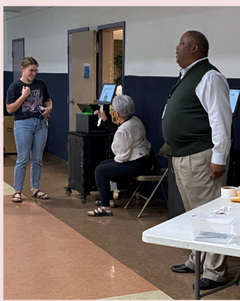
Poll workers at Towne Church stand ready to greet voters.