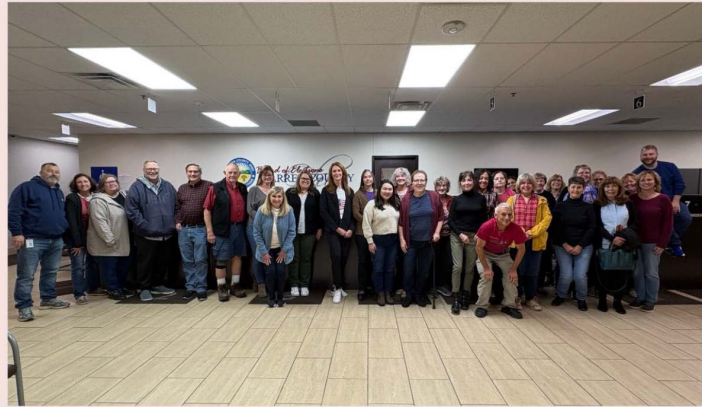
The gang's all here! Everyone at the B.O.E., whether part-time or full-time, posed for a group photo to celebrate another successful election season.