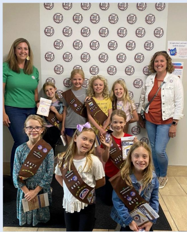
Brownie Troop #4477 visiting the B.O.E. to learn all about the voting process.