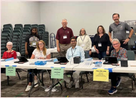
The crew at Southwest Church of Springboro.