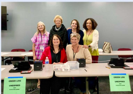
The Franklin Fire Department group all together.