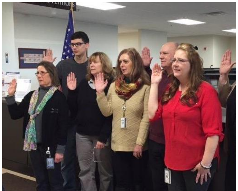
Office staff at Swearing in Ceremony